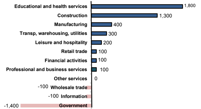
12-Month Employment Growth: Clackamas County August-2017 to August-2018 (Net gain: 2,700 jobs)

Clackamas County gained 2,700 new jobs from a year ago.