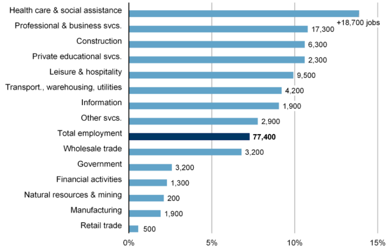
Portland Tri-County Employment Growth, 2024-2034

Portland Tri-County Industry Projections 2024-2034