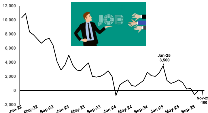
Year-over-Year Employment Growth Clackamas County: 2022-2025

Source: Oregon Employment Department, Current Employment Statistics, not seasonally adjusted